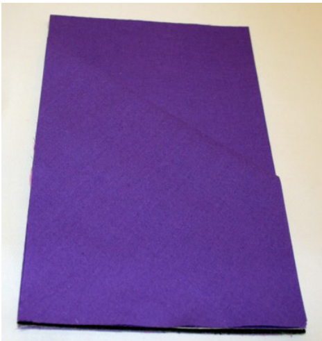
The trimmed pocket

Step 8 Satin stitch around all of the edges catching the pocket edges in the stitching. Use a wide stitch for this.